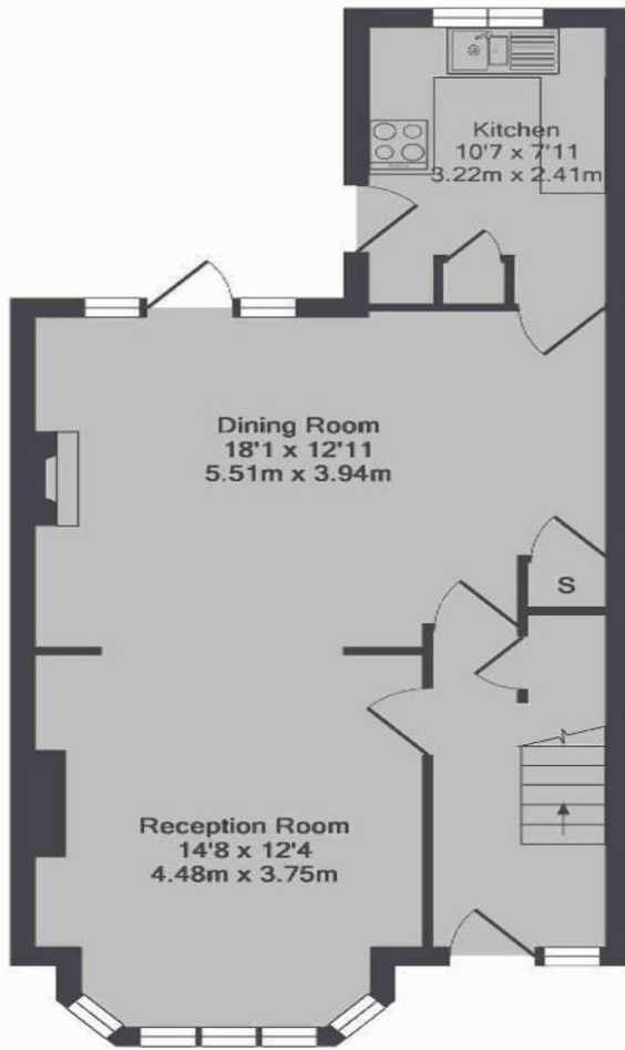
Ground Floor Approx. Floor